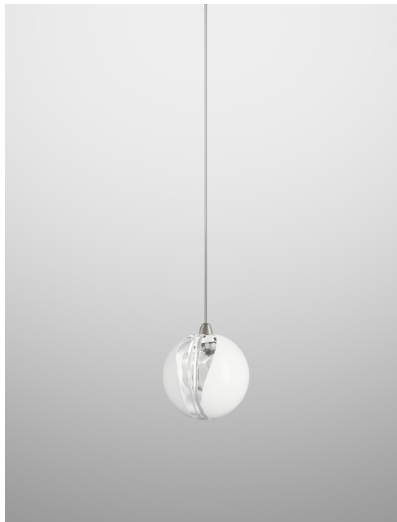
POC SP 16 CRBC NI G9 CE